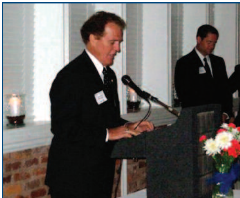
Congressman Phil Gingrey (R-GA/ΣΝ) addressed the attendees at the Atlanta PAC event.

Congressman Phil Gingrey (R-GA/ΣΝ) spoke and thanked the PAC for the support given to him and to many members of Congress. Congressman Gingrey also focused his remarks on the importance of getting the Collegiate Housing and Infrastructure Act attached to a bill and passed through Congress. He reaffirmed his commitment to CHIA and to doing what he could do for its passage.