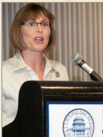
Congresswoman Kathy Castor (D-FL/ΔΔΔ)