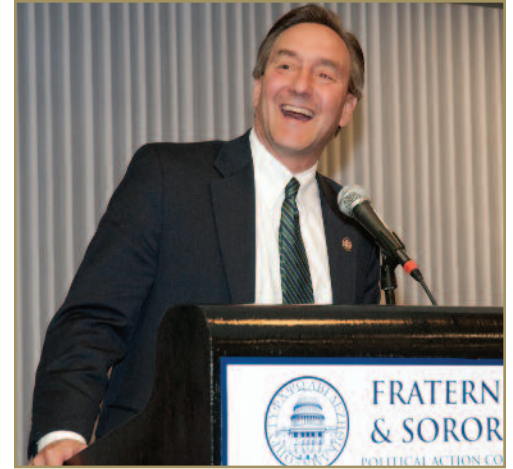
Former national president of FarmHouse, Congressman Rick Berg (R-ND/FarmHouse)

Please check our website ( www.fspac.org ) for forthcoming details on our 2012 PAC dinner.